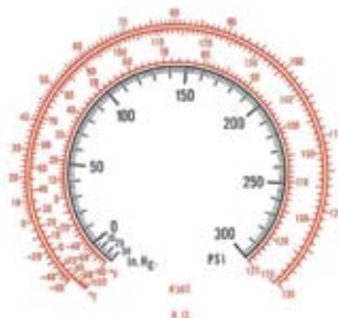
30" Hg Vacuum to 0 to 300 PSI Part Number Example: 25104-26B11DRB