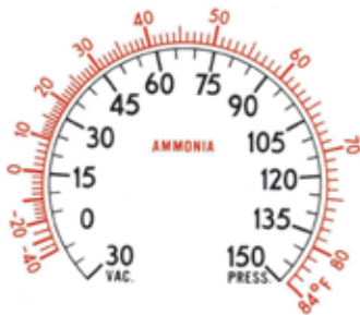
30" Hg Vacuum to 0 to 150 PSI Part Number Example: 25104-24B11DRA